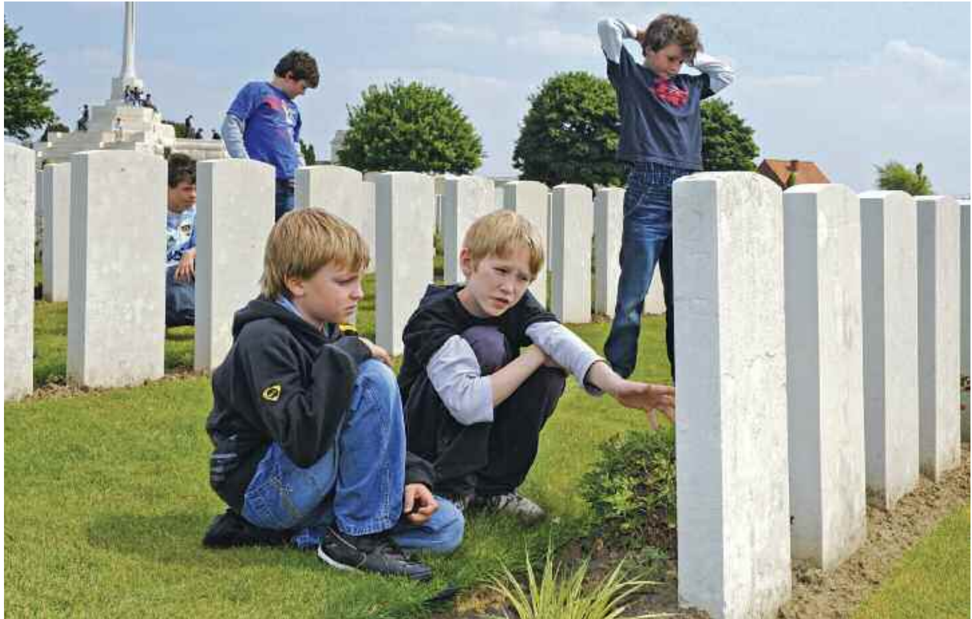
Historians in Flanders