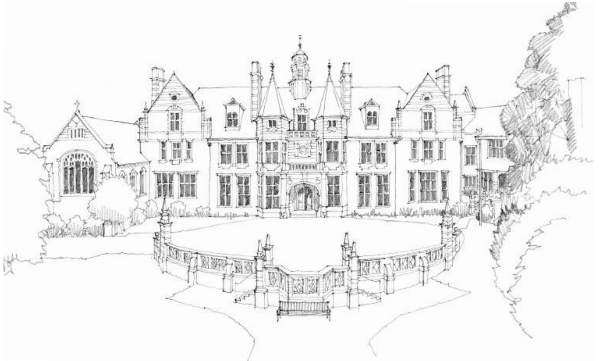
ST JOHN'S BEAUMONT