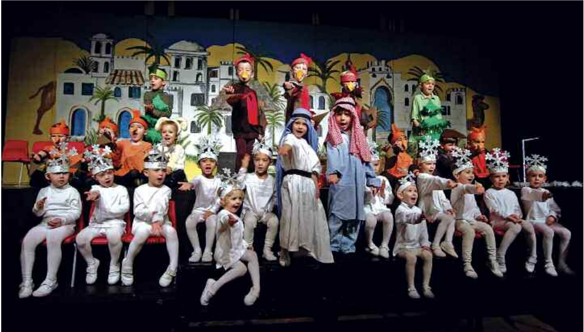
Boys from the Nicholas Owen Block perform their Nativity